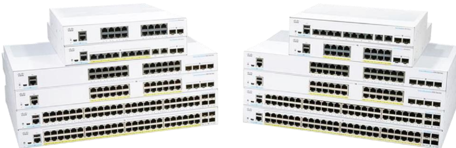
Figure 2. Cisco Business 250 series smart switches

The Cisco Business 250 Series is the next generation of affordable smart switches that combine powerful performance and reliability with a complete suite of the features you need for a solid business network. These switches provide flexible management options, comprehensive security capabilities and Layer 3 static routing features far beyond those of an unmanaged or consumer-grade switch, at a lower cost than for fully managed switches. When you need a reliable solution to share online resources and connect computers, phones, and wireless access points, Cisco Business 250 Series Smart Switches provide the ideal solution at an affordable pricing point.